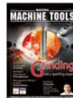
Modern Machine Tools