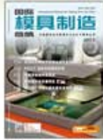
International Mold & Die Making News for China