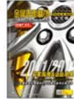
Metal Finishing China & Asia