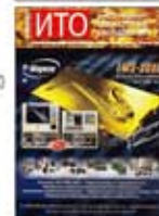
ITO Metalworking Russia