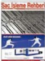
Sac Isleme Rehberi