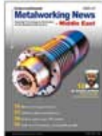
International Metalworking News - Middle East