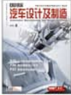
Automotive Manufacturing & Design for China