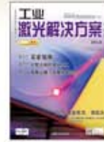
Industrial Laser Solutions China