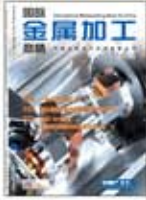
International Metalworking News for China