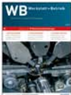
Werkstatt und Betrieb