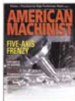
American Machinist (E-magazine)