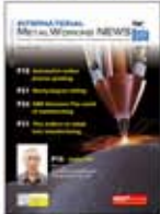
International Metalworking News for Asia