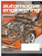
Automotive Engineering International