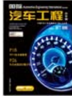
Automotive Engineering International Chinese Edition