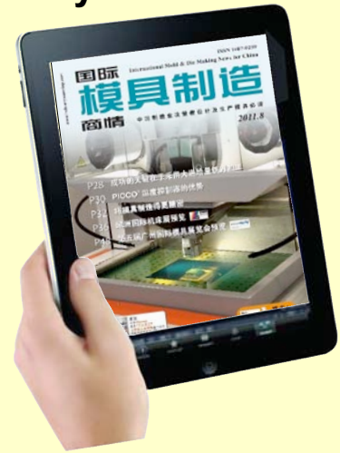
Your Ad seen on the iPhone / iPad versions of the Magazines and accessible from all Android smart phones