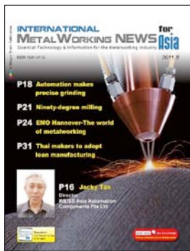
International Metalworking News for Asia