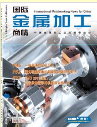
International Metalworking News for China

The # 1 Metalworking Multimedia Program Targets Buyers