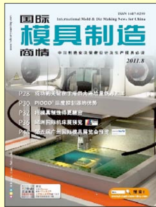
International Mold & Die Making News for China