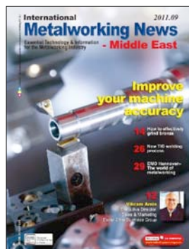
International Metalworking News - Middle East

Your Product Showroom delivered to Android mobile devices!