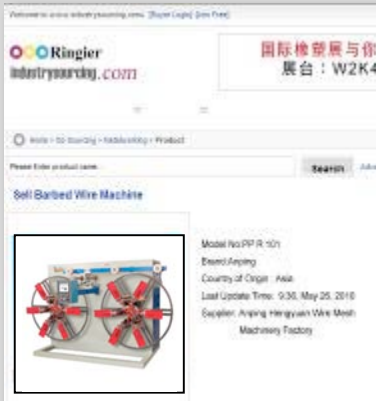
Hosted on Industrysourcing.com